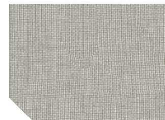
Tessuto - 1986