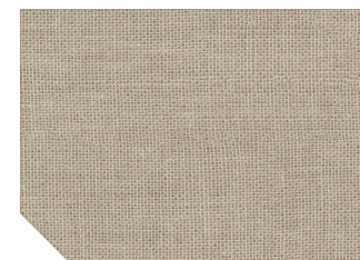
Jute - 2610