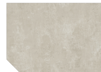
Underground - 1984