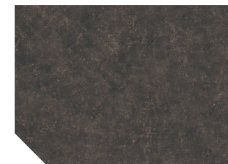
Cobalt - 1706