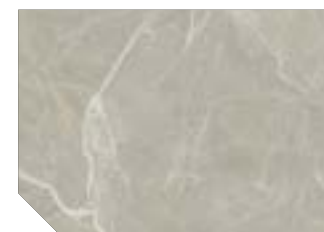
Harley - 2383