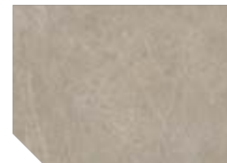
Breccia Imperiale - 3097