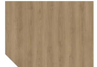
Sigma - 3207