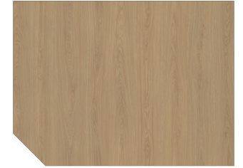
Moccasine - 3194